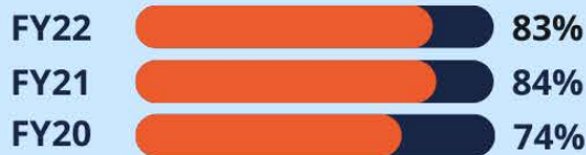
Percentage of Appointments Kept with CMHC

525 Appointments were scheduled in FY22. 436 clients kept their appointment with a CMHC. (1% decrease from previous year)